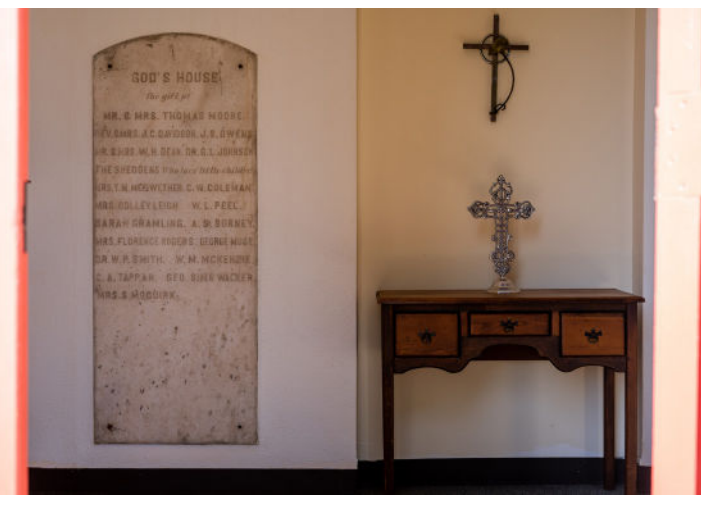
*Select photos by Resolute Photo.